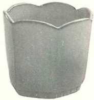
37—4" HEXAGONAL PLANTER 1.50