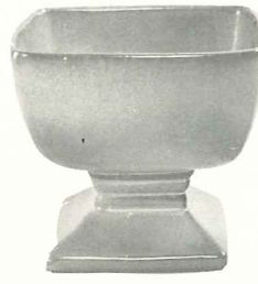
23A—6" SQ. PEDESTALLED VASE—4.00