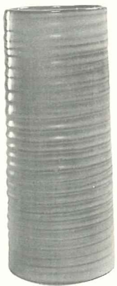
72—10" RINGED CYLINDER VASE—4.00