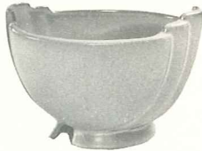
35—4x6" FOOTED PLANTER 2.50