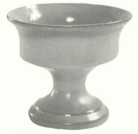
F52—7" PEDESTALLED URN—4.00

THIS PAGE AVAILABLE IN ALL COLORS — ADD 50% FOR FLAME.