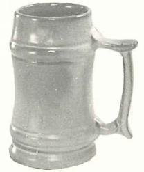
M2—6"—18 OZ. MUG—3.00