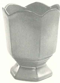
65—6½" HEXAGONAL VASE—3.50