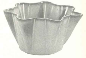
F33—3¾x7" FLUTED PLANTER 3.00