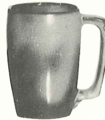
5M—5½"—16 OZ. MUG—3.00