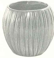
T7—3½" COCONUT PLANTER 2.00