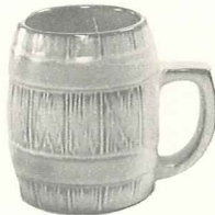
97M—4½"—16 OZ. MUG—3.00