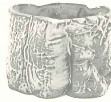
B3—4½" CORK BARK PLANTER 3.00