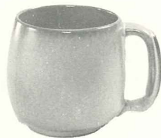
4M—4½"—18 OZ. MUG—3.00