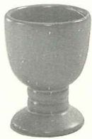
26LC—4½"—6 OZ. TUMBLER VASE—2.00